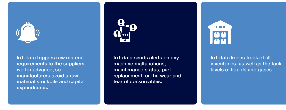
Figure 3: IoT data through an MES

decisions at the right time, as well as to engage manufacturers, the supply chain and suppliers. The data can also help tie the manufacturing ecosystem together, as shown in Figure 3.