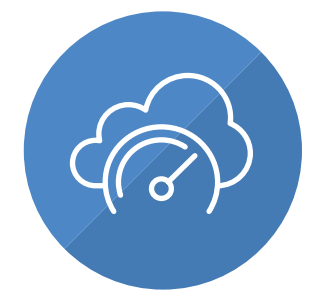
Improve the online payment rate by 7% of total membership

With the NTT DATA solution, the client was able to: