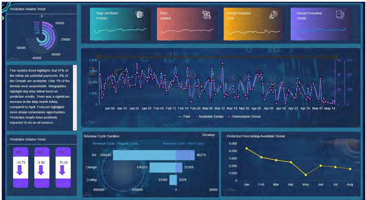
Figure 2: NTT DATA Denial Management AI Platform